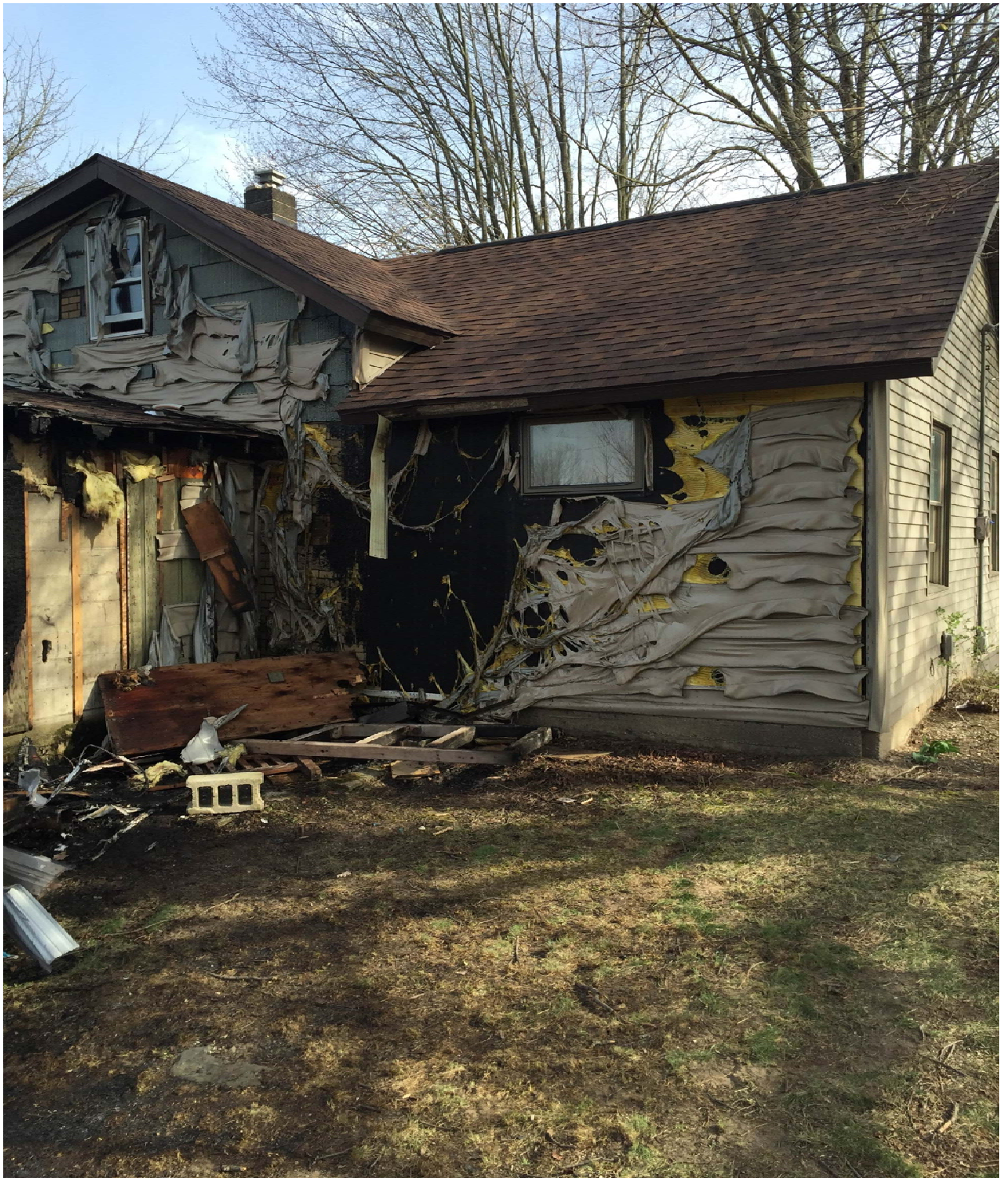
Heat damage from exposure to RV fire at 4408 Twenty Mile Road on 4-18-16